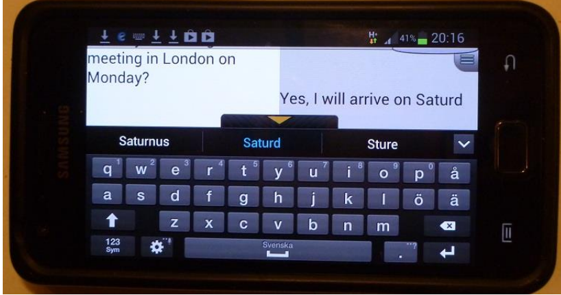
Figure 2: Example of total conversation app in RTT mode: Omnitor eCmobile.

RTT editing features includes at least new line and erase last character with remote effect as specified in ITU-T T.140[4]. The erasure has no specific limit other than the terminal display buffer. It can go into earlier "messages" previously ended by a line separator.